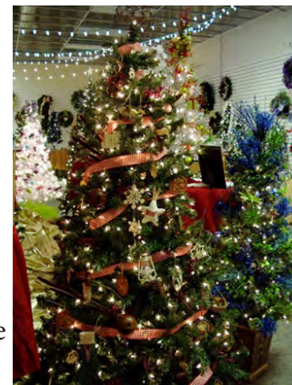
Decorated holiday trees at the 2nd Annual Take A Bough Event